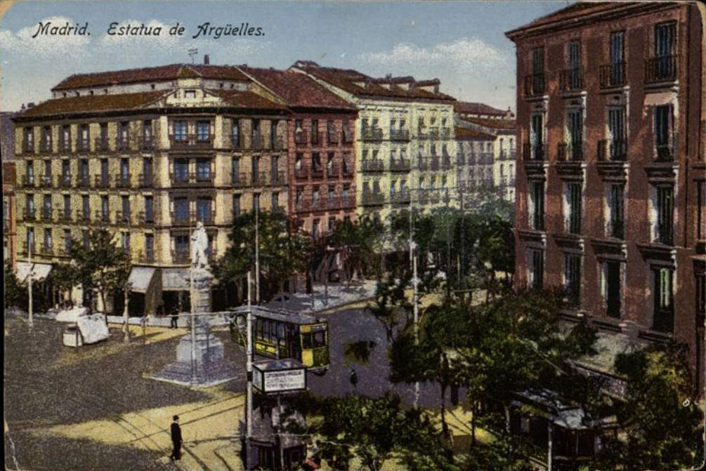
Madrid. Estatua de Argüelles.