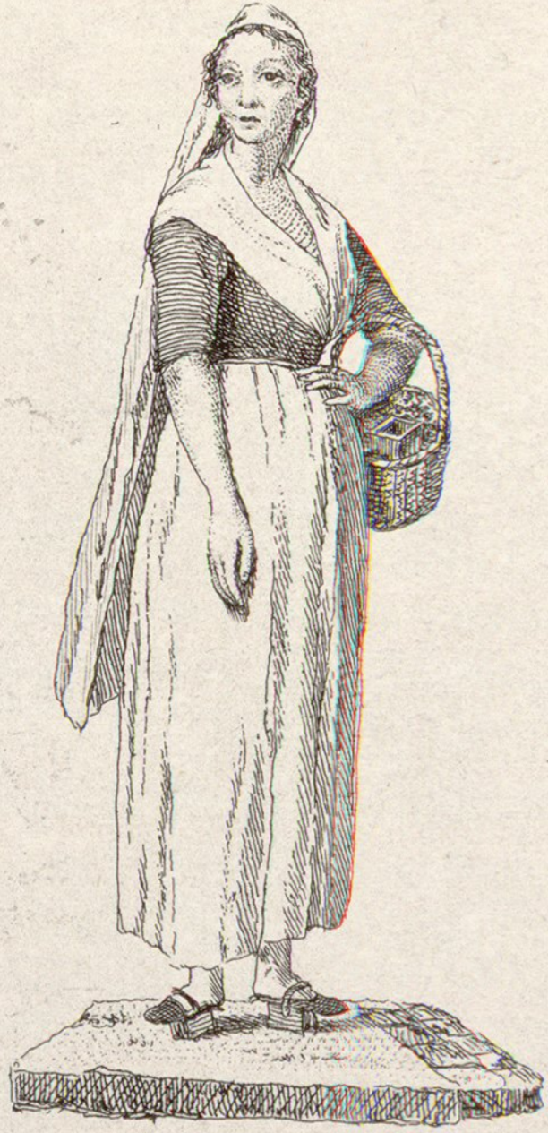
Abellanitas Dulces Abellanees