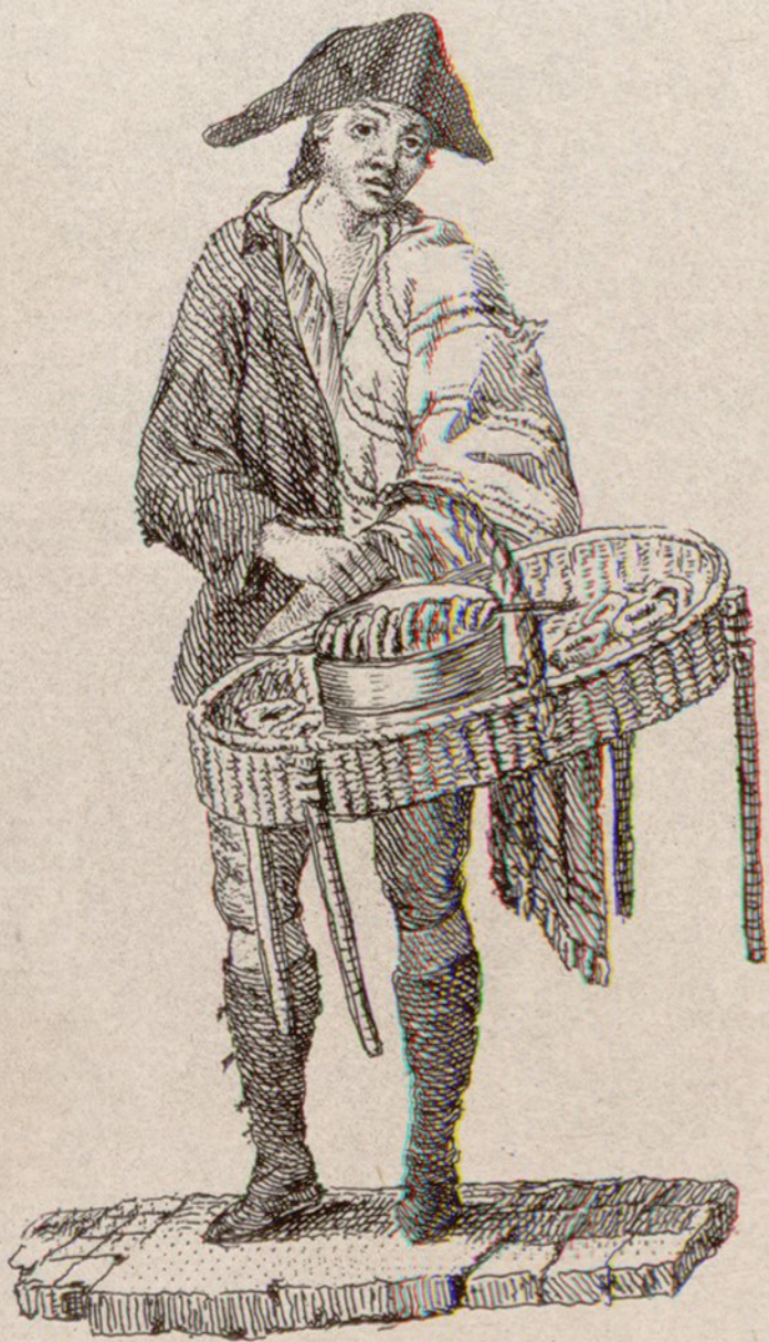
Queritierrecit. quantos á Ochabit.