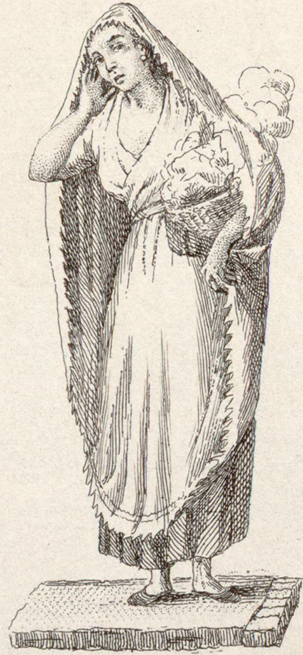
Alas Calientes y Gordas