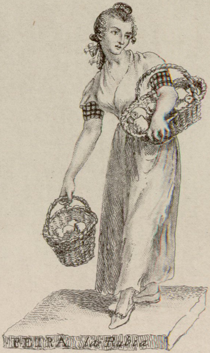
La limonera... toito agrio.