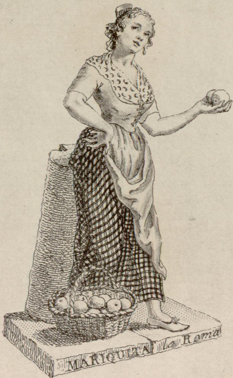
Naranjas dulces... naranjas.