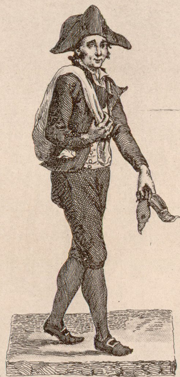
Hay zapatos viejos que vendel.