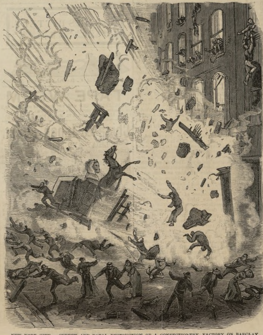
NEW YORK CITY.—SUDDEN AND FATAL DESTRUCTION OF A CONFECTIONERY FACTORY ON BARCLAY STREET, ON THE AFTERNOON OF DECEMBER 20TH.