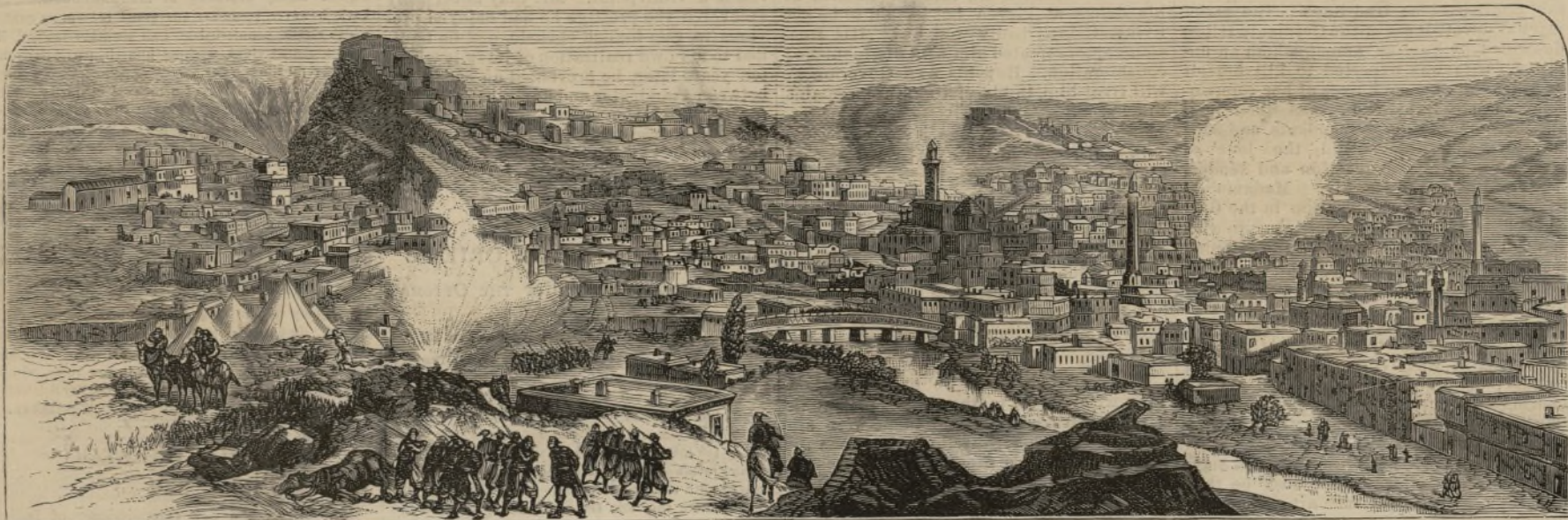
ARMENIA.—THE ASSAULT OF THE RUSSIANS ON THE FORTRESS OF KARS, ON THE NIGHT OF NOVEMBER 17TH.

The Pictorial Spirit of the Illustrated European Press.—SEE PAGE 307.