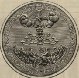
BALTIMORE, MD.—MEDAL SUPPOSED TO HAVE BEEN PRESENTED TO LUTHER.

Almost simultaneously with the explosion, the Barclay Street wall fell outward at the base, and thus brought the upper stories crashing down with it. Then the beams of the Barclay Street house gave way at the southern end, and bowed inward as they fell. Some of the bricks of the wall were thrown considerable distances, and the concussion of the explosion broke the windows in most of the houses