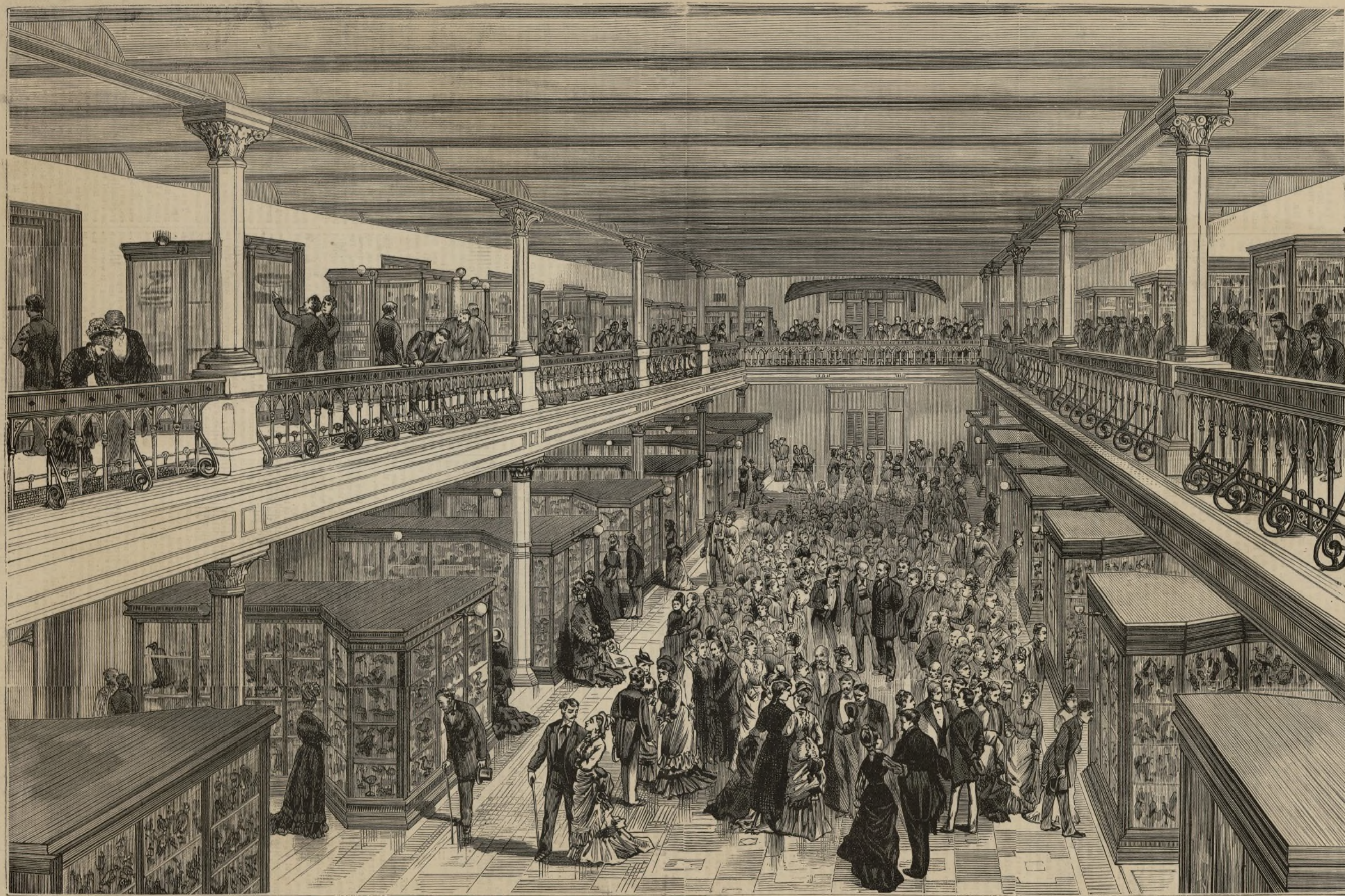
NEW YORK CITY.—THE PRESIDENTIAL VISIT—PRESIDENT HAYES PARTICIPATING IN THE OPENING CEREMONIES OF THE MUSEUM OF NATURAL HISTORY, MANHATTAN SQUARE, EIGHTH AVENUE AND SEVENTY-NINTH TO EIGHTY-FIRST STREET, ON SATURDAY, DECEMBER 22D.—SEE PAGE 311.