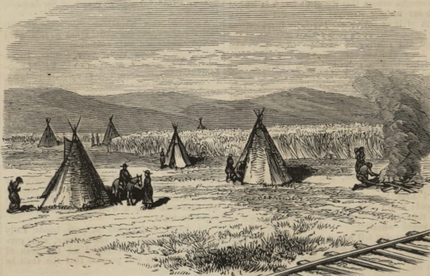
INDIAN LODGES NEAR CARLIN, ON THE C. P. R. R.

LEAVING Wells, our midnight and moonlit ride crosses the dreary alkali plain, past Tulasko, Bishop's, Deeth, Halleck, Peko and Osino—which melodious names pertain to as many little telegraph-stations dotted along the route—and brings us by seven o'clock of a sharp, cold morning to the breakfast-station of Elko. Before arriving at this oasis, the wakeful eyes at the curtained section windows have discovered a new feature in the landscape, in the shape of certain dark cones sprinkled over the divides among the sage-brush, around which small, moving figures may be seen, all tending rapidly towards our train. With this preparation we are not surprised at being saluted with a shriek of "Indians!" from the young lady on the platform; and as the cars "slow-up" before the long station, the artists dive out, sketch-books in hand, and the rest of us follow more leisurely, to inspect these denizens of the desert. A crowd of them have come down from the dirty, smoke-blackened teepees on the bluff, and are pressing around the steps of the cars—women and children all of them, and all as dirty as their lodges. It is not for their picturesqueness certainly that we study them; there is none of the