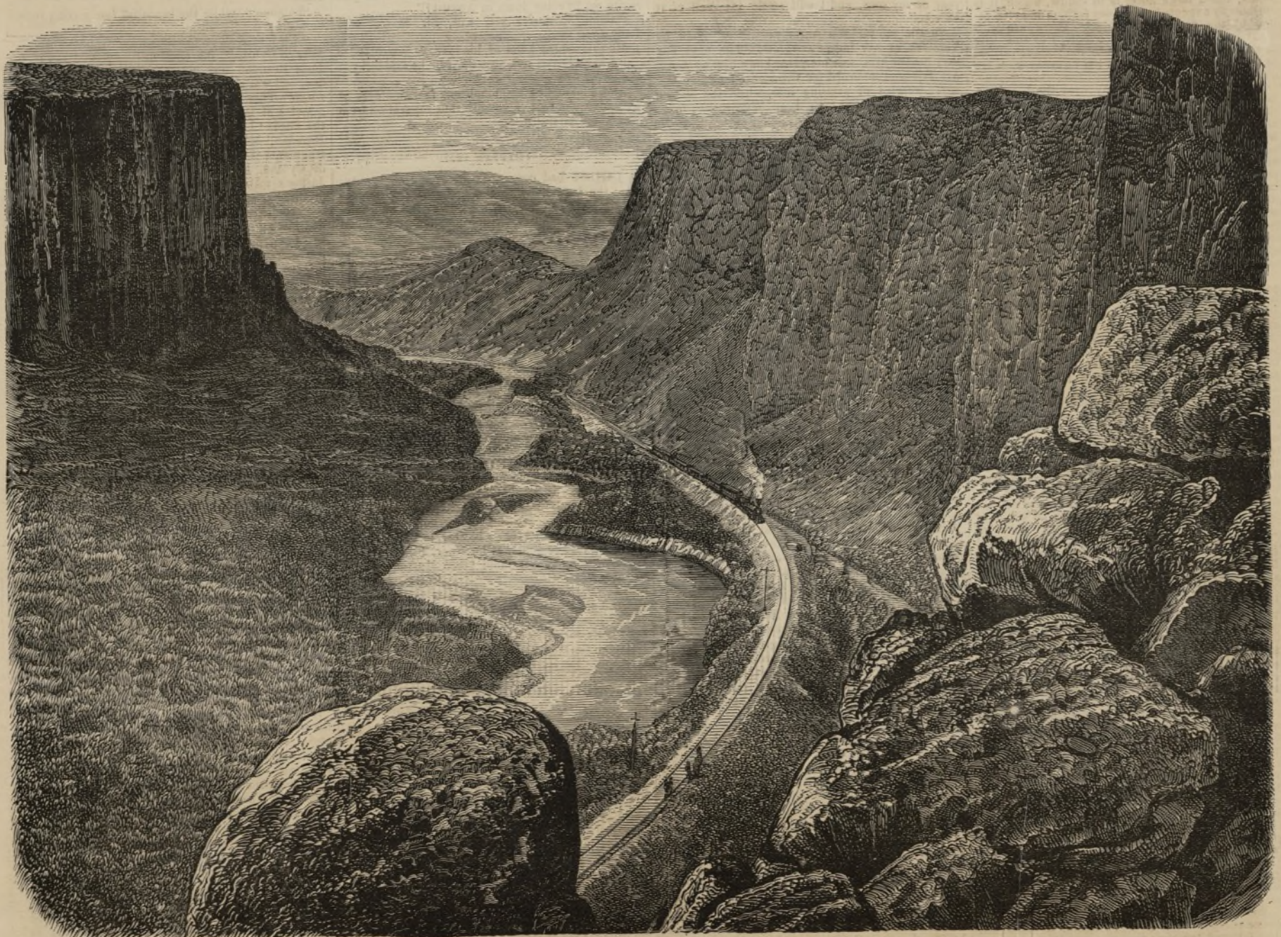
THE PALISADES OF THE HUMBOLDT, NEAR PALISADE STATION, C. P. R. R.

ACROSS THE CONTINENT.—THE FRANK LESLIE TRANSCONTINENTAL EXCURSION—THROUGH THE "GREAT AMERICAN DESERT" TO THE PALISADES OF THE HUMBOLDT.—FROM SKETCHES BY OUR SPECIAL ARTISTS.