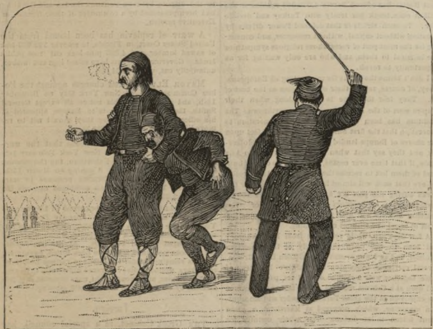
BULGARIA.—PUNISHING A TURKISH SOLDIER FOR THEFT.