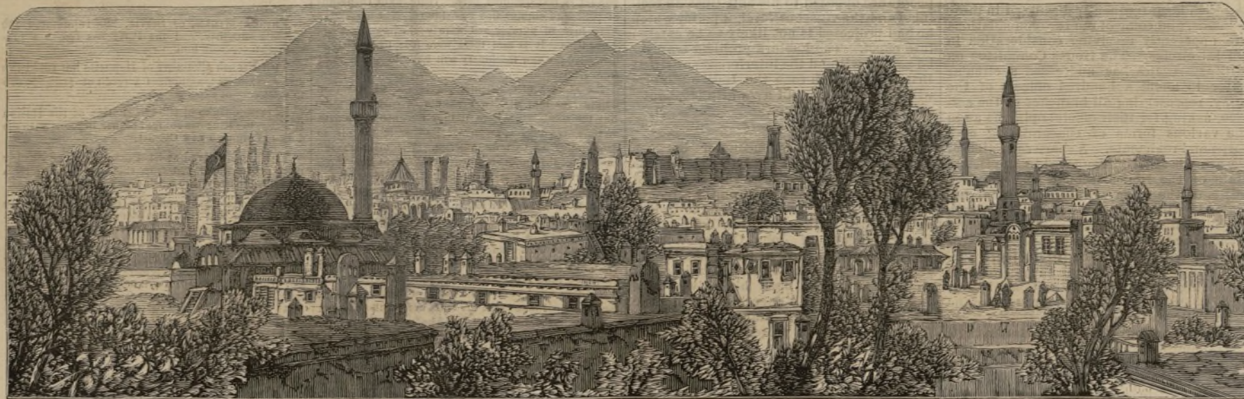
ARMENIA.—THE FORTRESS OF ERZEROU, LOOKING WEST FROM THE BRITISH CONSULATE.