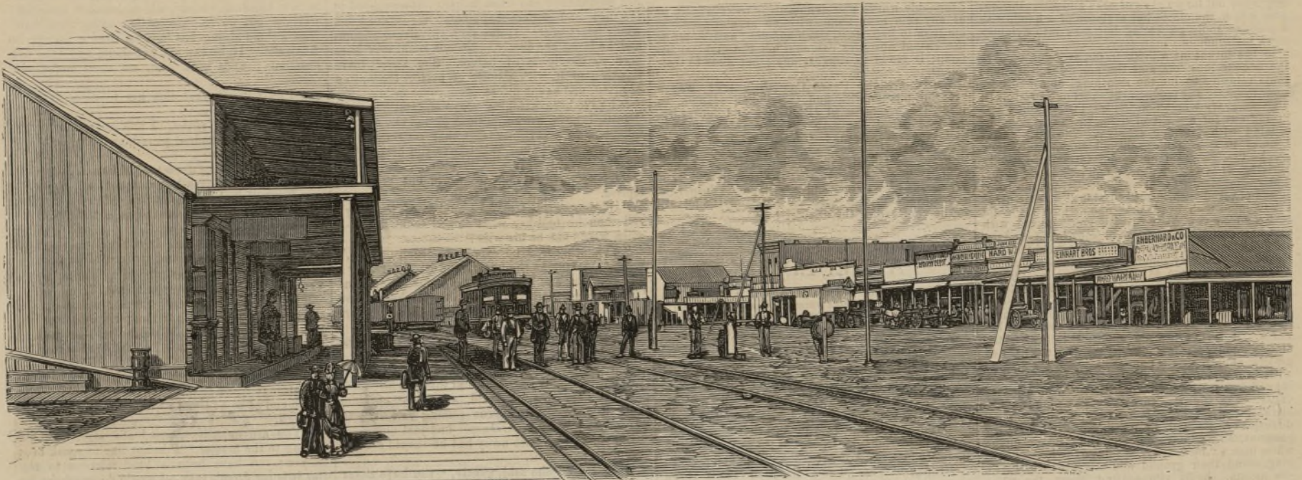
THE TOWN OF ELKO, NEVADA, ON THE HUMBOLDT DESERT.

LEAVING Wells, our midnight and moonlit ride crosses the dreary alkali plain, past Tulasko, Bishop's, Deeth, Halleck, Peko and Osino—which melodious names pertain to as many little telegraph-stations dotted along the route—and brings us by seven o'clock of a sharp, cold morning to the breakfast-station of Elko. Before arriving at this oasis, the wakeful eyes at the curtained section windows have discovered a new feature in the landscape, in the shape of certain dark cones sprinkled over the divides among the sage-brush, around which small, moving figures may be seen, all tending rapidly towards our train. With this preparation we are not surprised at being saluted with a shriek of "Indians!" from the young lady on the platform; and as the cars "slow-up" before the long station, the artists dive out, sketch-books in hand, and the rest of us follow more leisurely, to inspect these denizens of the desert. A crowd of them have come down from the dirty, smoke-blackened teepees on the bluff, and are pressing around the steps of the cars—women and children all of them, and all as dirty as their lodges. It is not for their picturesqueness certainly that we study them; there is none of the