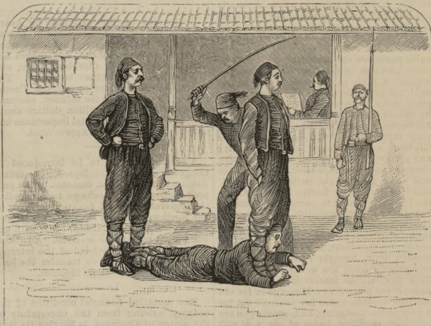
BULGARIA.—PUNISHING A REFRACTORY TURKISH SOLDIER.