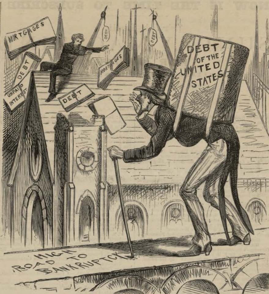
A CALL FOR ASSISTANCE.

27 Park Place, New York. P. O. Box 4,488.