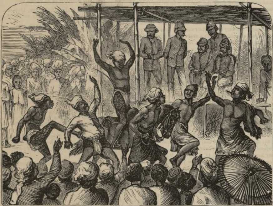
BRITISH BURMAH.—A NATIVE PONY RACE AT JOUNGHOO.