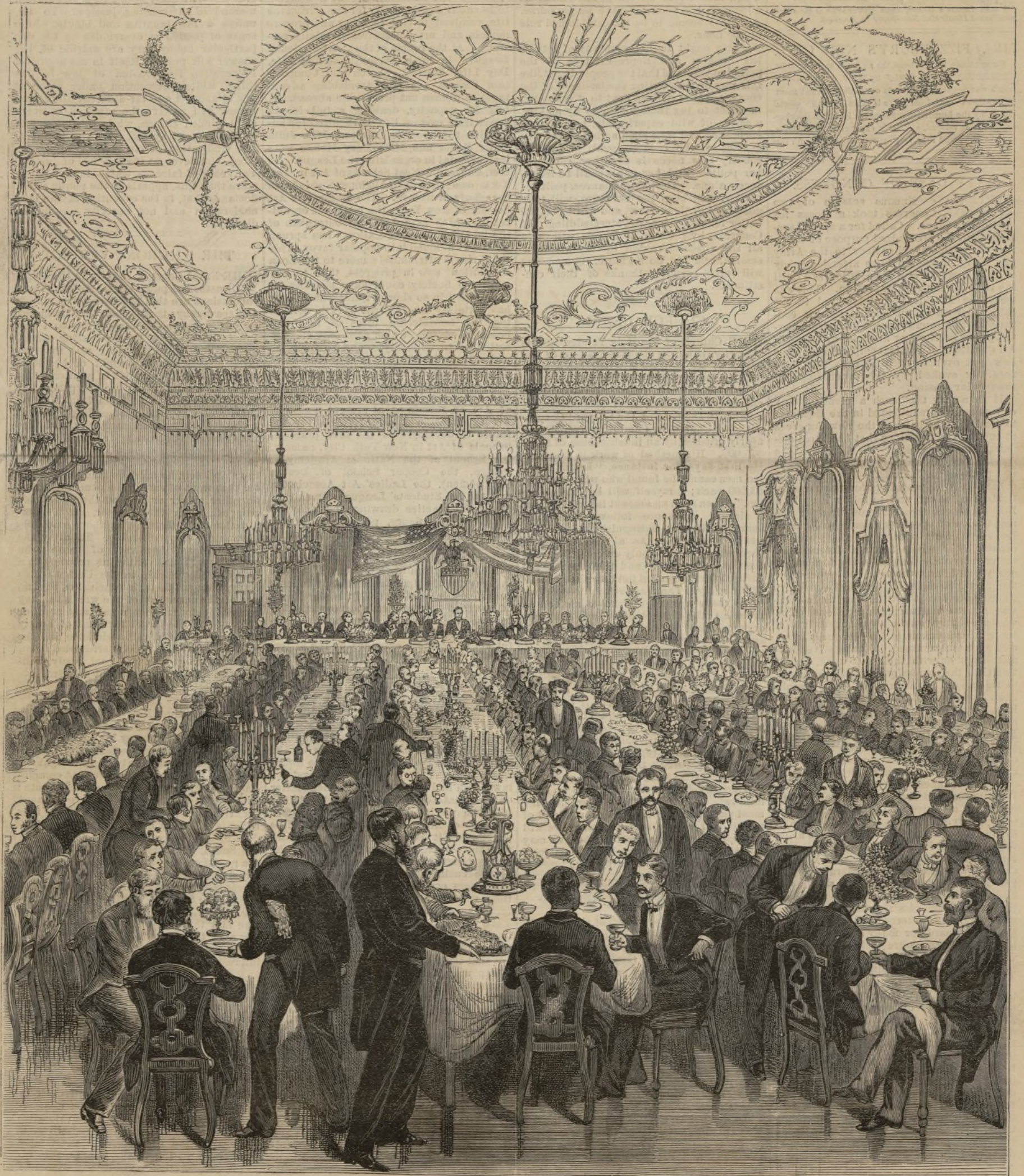
NEW YORK CITY.—THE PRESIDENTIAL VISIT—PRESIDENT HAYES ENTERTAINED AT THE ANNUAL DINNER OF THE NEW ENGLAND SOCIETY, AT DELMONICO'S, SATURDAY EVENING, DECEMBER 22D.—SEE PAGE 307.

[PRICE 10 CENTS. $4.00 YEARLY. 12 WEEKS, $1.00.]