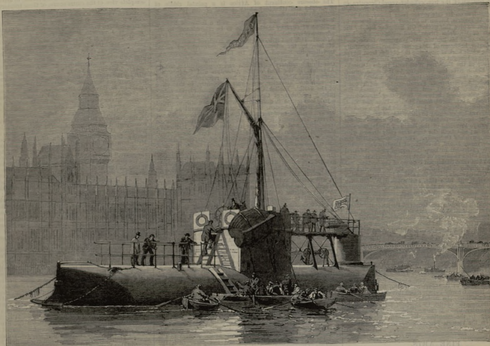
THE CYLINDER SHIP CLEOPATRA, WITH THE OBELISK, AT WESTMINSTER BRIDGE.