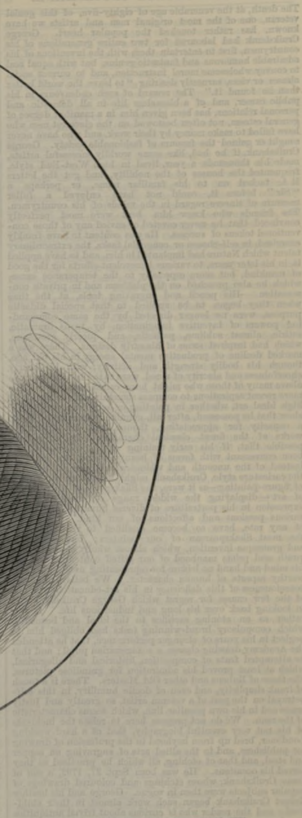
THE LATE MR. GEORGE CRUIKSHANK.