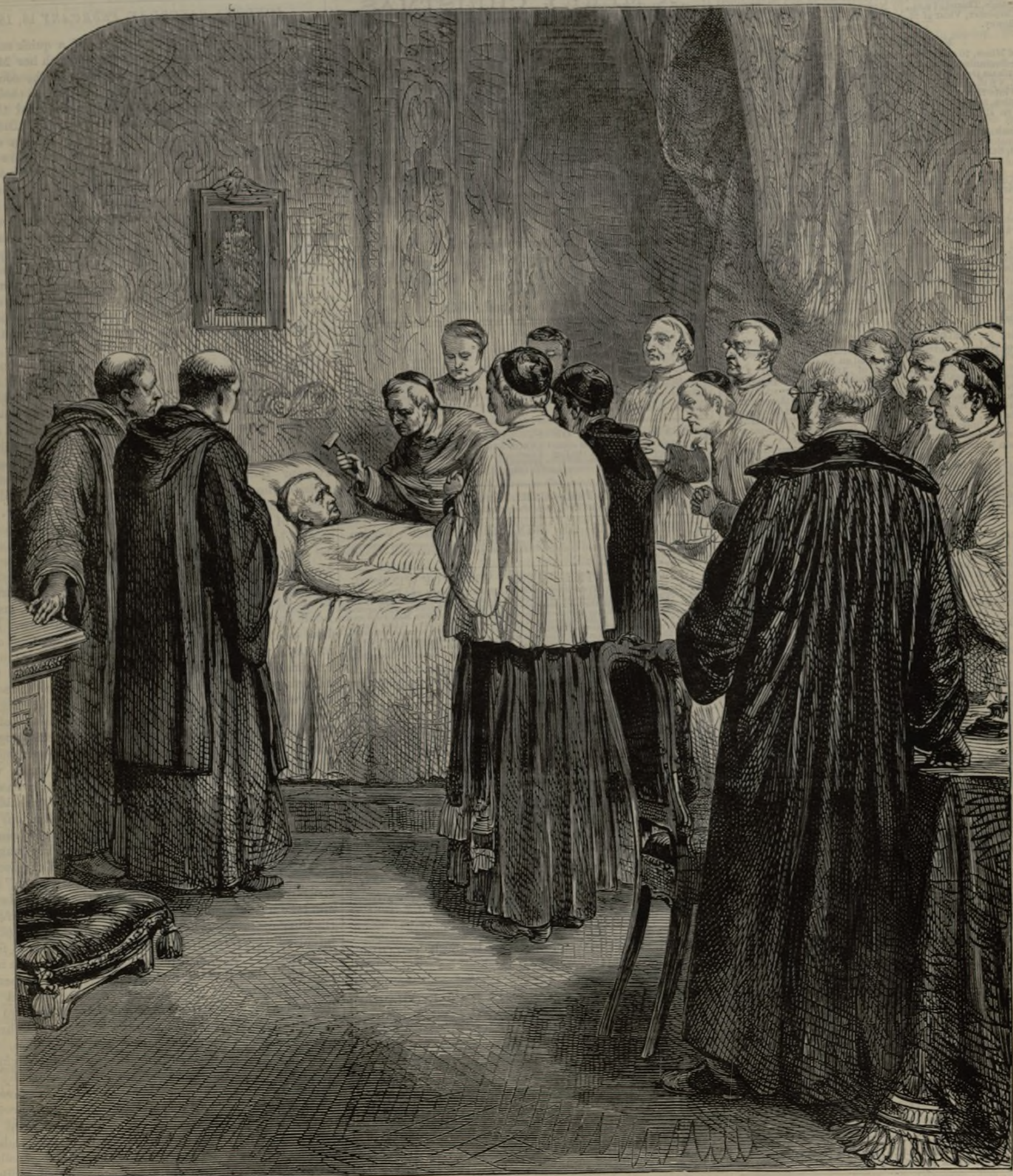
THE CARDINAL CAMERLENGO VERIFYING THE DEATH OF THE POPE.

WITH TWO SUPPLEMENTS SIXPENCE. By Post, 6d.