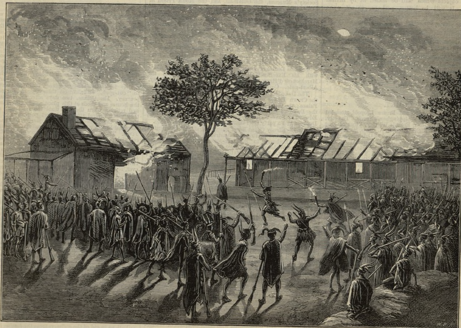
BURNING OF THE DRAAISBOCH HOTEL BY THE KAFFIRS.