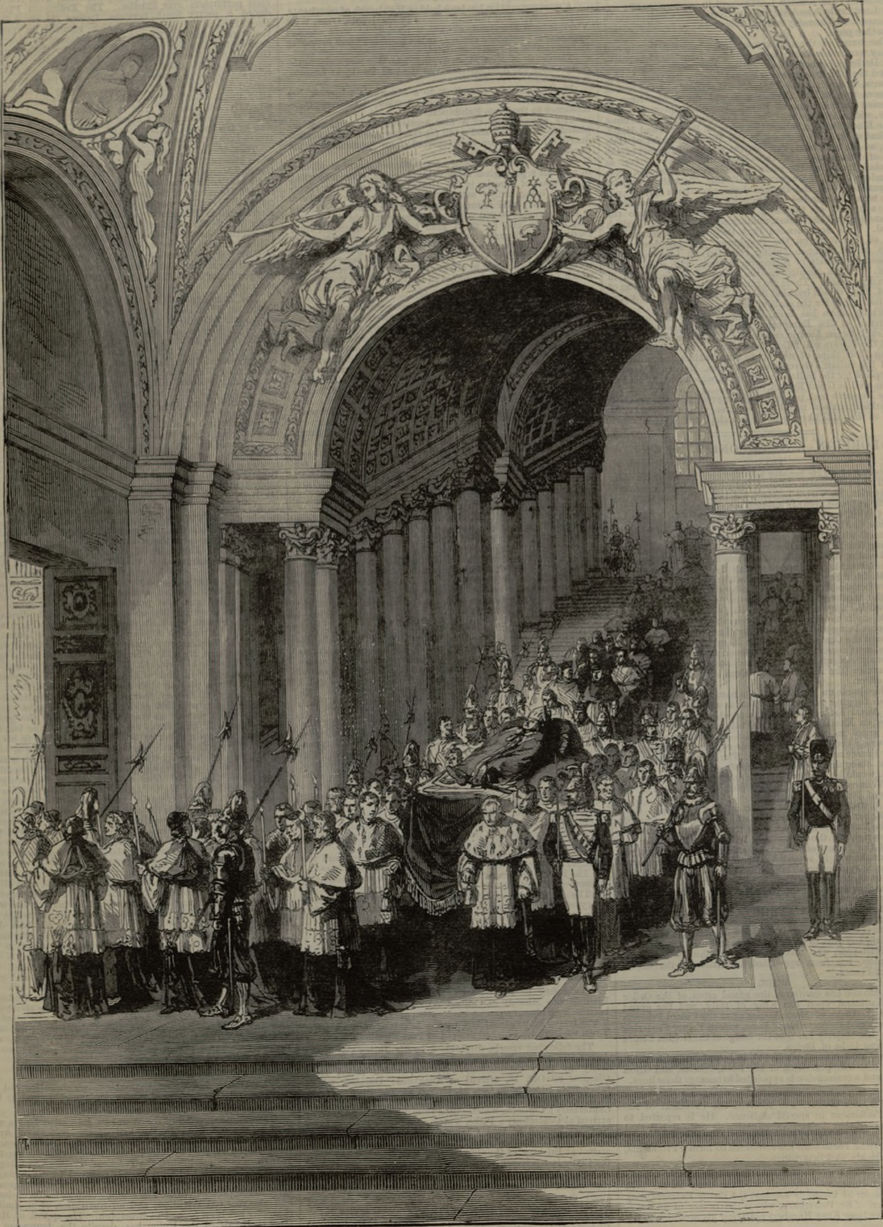
GRAND STAIRCASE OF THE VATICAN: FUNERAL PROCESSION OF A POPE.

THE ILLUSTRATED LONDON NEWS, FEB. 16, 1878. — 141