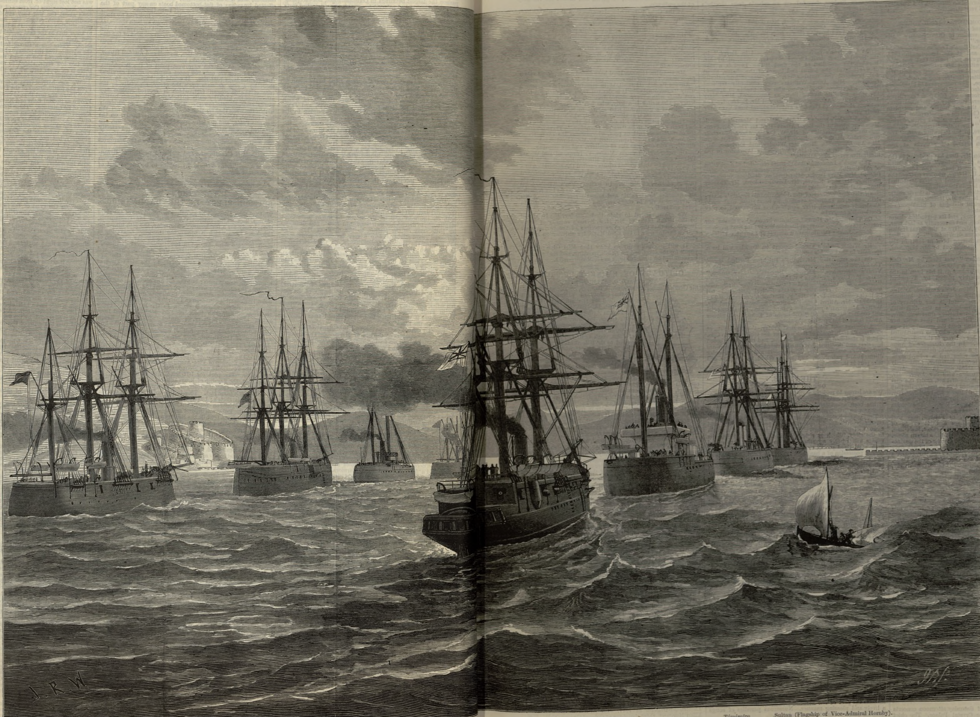
Port Division: Research.