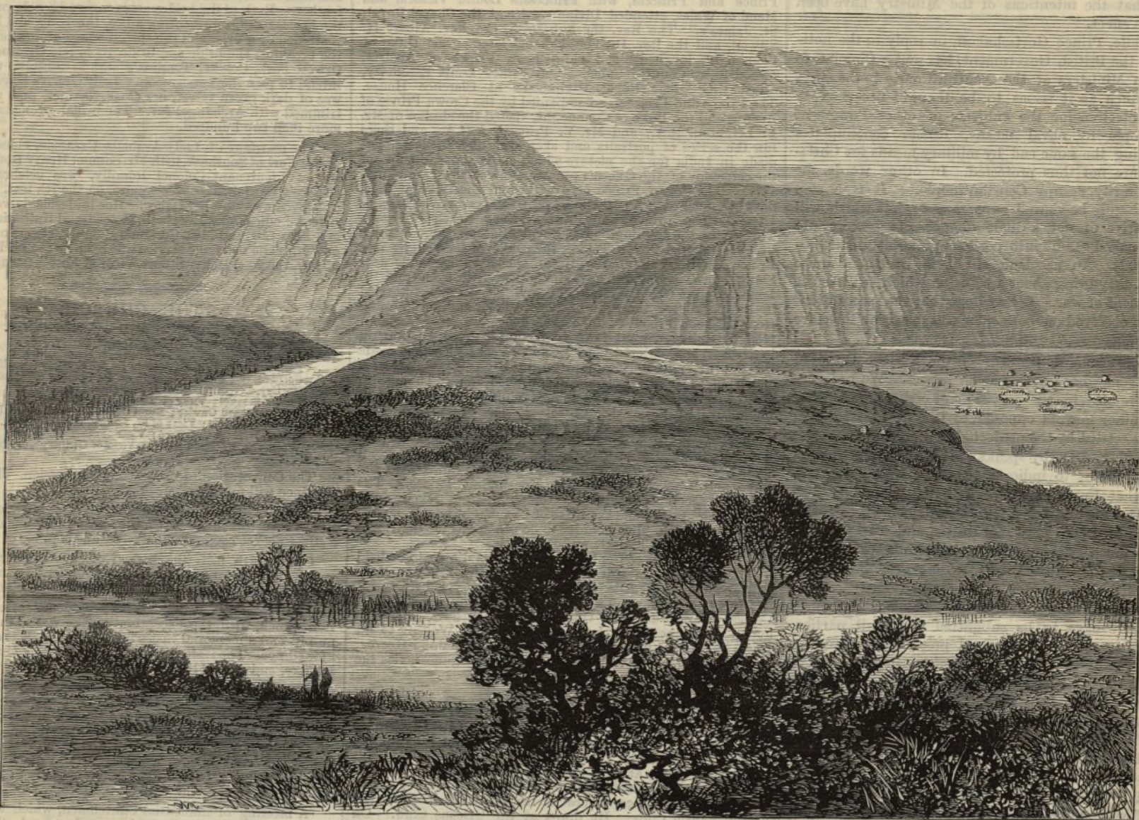
THE GREAT KEI RIVER, AND MONI'S KOP, FROM THE NORTH.