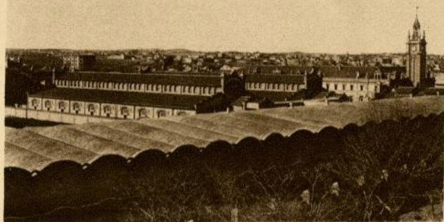
THE NEW SLAUGHTER-HOUSE (Madrid)

The earliest mention of this Municipal service is that in 1502, animals to be slaughtered were taken to a house