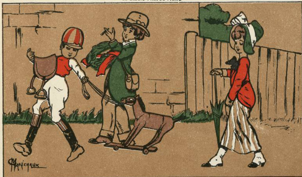
LA RENTRÉE AUX BALANCES