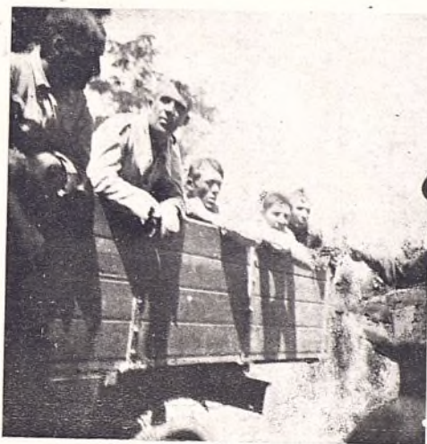
FASCIST PRISONERS A Falangist leader and his dupes captured at Villanueva de la Cañada.