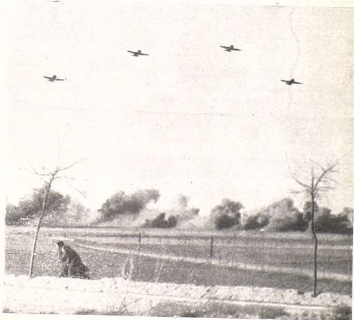
Enemy bombers trying to halt our advance.