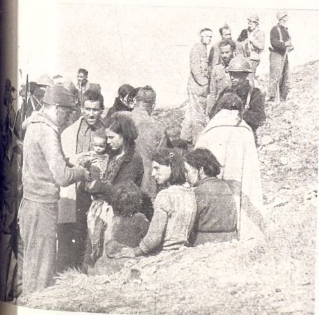
Peasants liberated from the fascists.